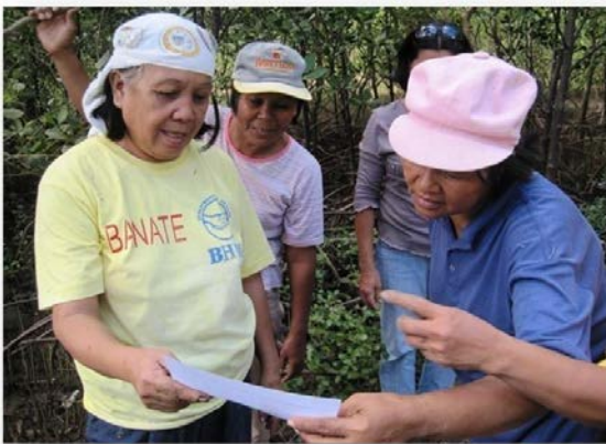
Discussing mangrove replanting plans, Philippines.