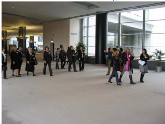
Women fisheries representatives descend on the European Parliament.