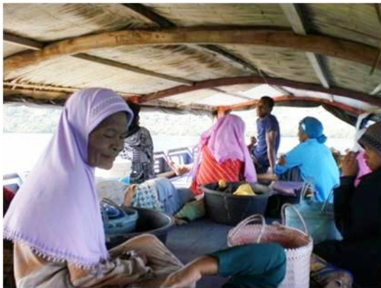
Pantar islands (Indonesia) women on their way by inter-island ferry to market their fish.