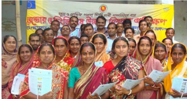
Graduating couples, Kulna, Bangladesh.

The global supply chain for farmed giant tiger prawn, Penaeus monodon , is one of Asia's most important and it has been subjected to repeated trade upsets over product quality and production methods. In