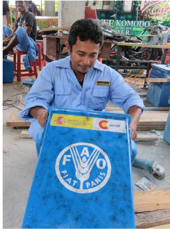
Making fiber glass cool boxes in Indonesia