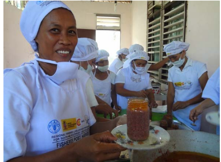
Working with women's groups in the Philippines to enhance the quality of their shrimp paste products