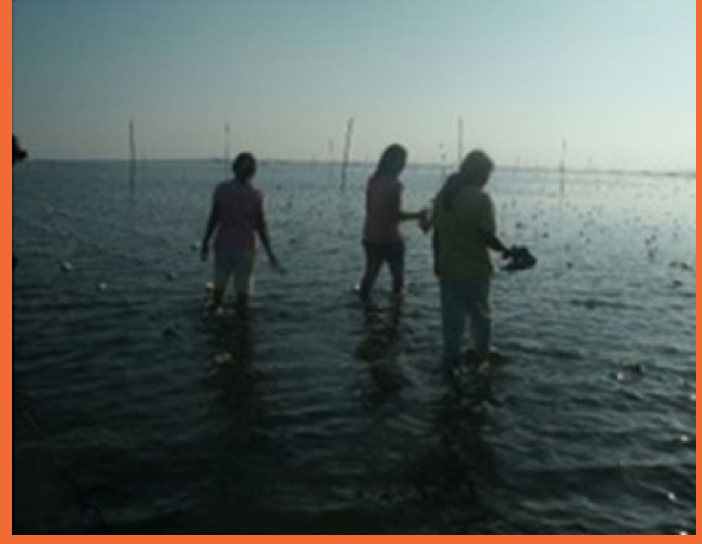
Philippine women seaweed farmers inspect their line early in the morning.