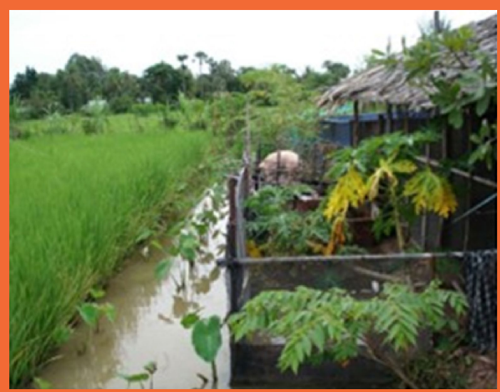
Rice fish farming, cambodia.

The project will be administered from Asian Institute of Technology (AIT) in partnership with the Cambodian Institute for Research and Rural Development (CIRD), and The University of the Philippines Visayas (UPV) and managed and implemented by GAFS ExCom and other members. Read the detailed GAFS Story here: https://www.genderaquafish.org/2023/10/05/ gena-developing-gender-responsivemonitoring-in-nbcs-aquaculture-projects-insoutheast-asia/