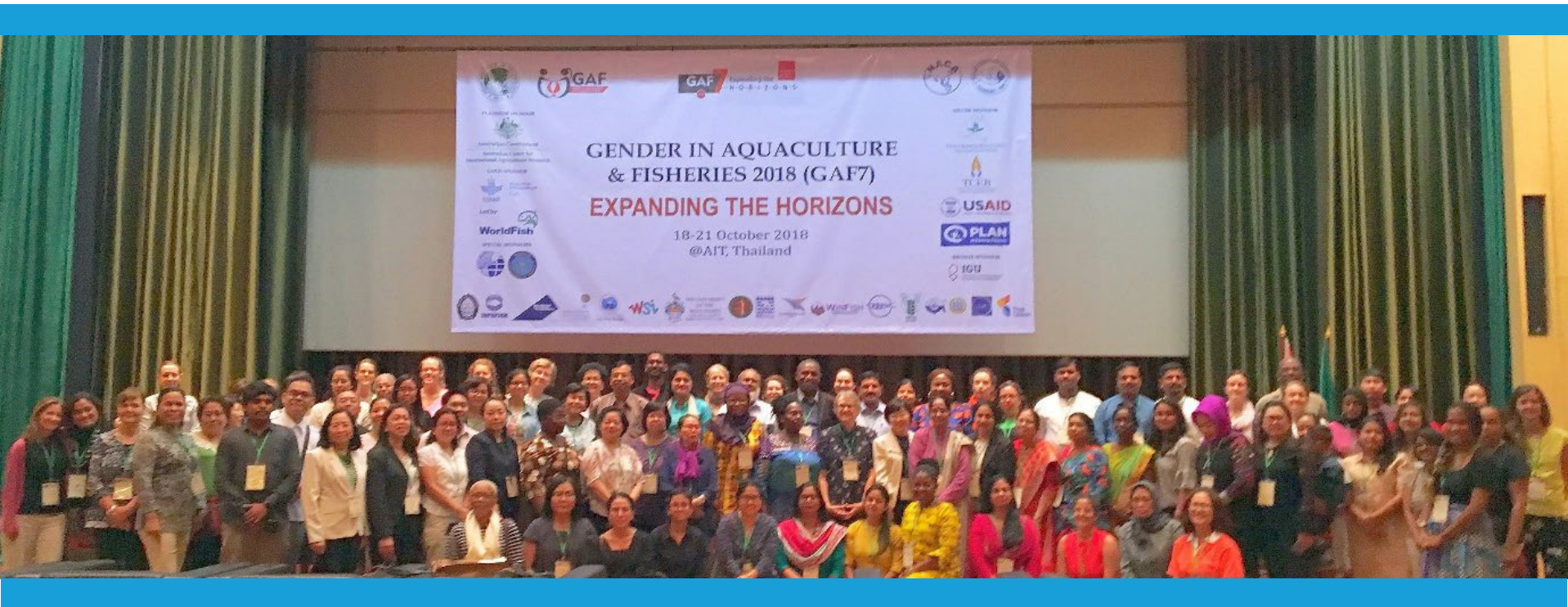
Expanding our future horizons: group photo at the GAF7 closing session.